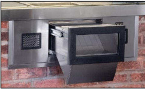
UL Rated Level I